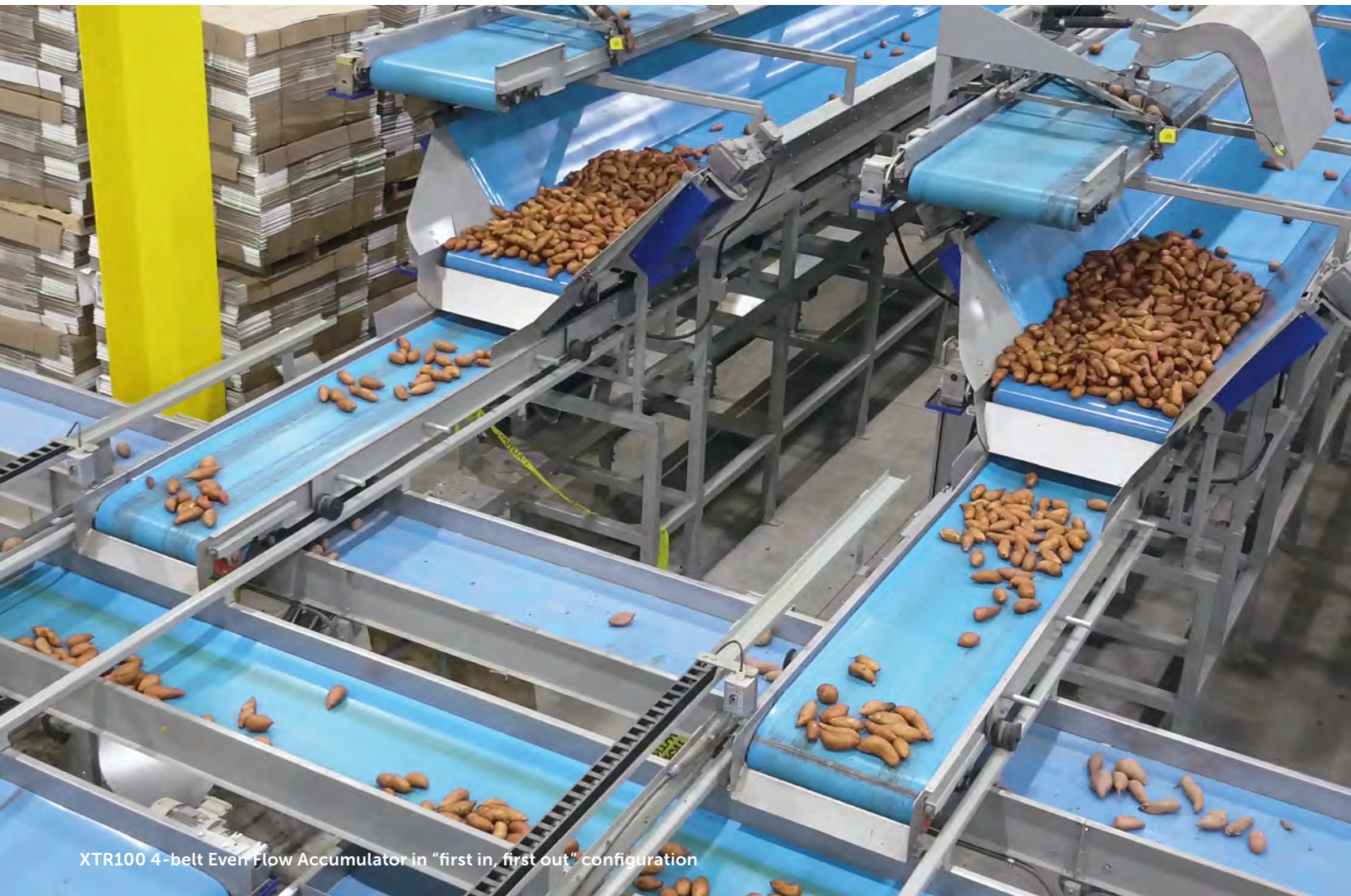
XTR100 4-belt Even Flow Accumulator in "first in, first out" configuration

Combining our deep knowledge of the fresh produce industry with rigorous engineering and quality manufacturing to build the best 4-belt even flow accumulator available: the XTR100.